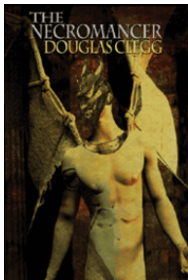
Cover Art by Caniglia

Available to download at http://www.whc2004.org/death.jpg